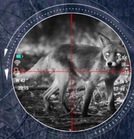
After image shift zero