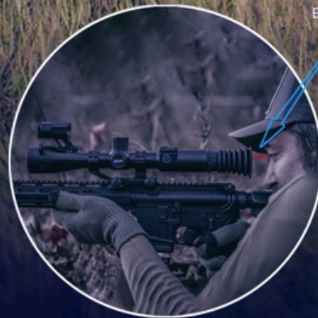
Eye relief 40mm

The DS incorporates 100mm eye relief to provide clear target visibility. This provide enough distance to allow for recoil and safe shooting regardless of what platform you are using. There is also a removable rubber eye cup that provides cushion and concealment of the digital diplay.