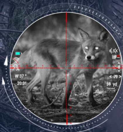
Before image shift zero

Sighting your scope has never been easier. After taking your first shot, simply move the digital reticle crosshairs to the actual impact point of the projectile on the paper target and save this location in the device. The device will automatically recenter the reticle cross hairs and adjust your new center point to where it should be located for future shots. 1 shot, that's all it takes!